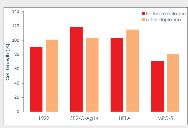
Figure 2: Comparison of cell growth on different cell lines from one batch of FBS. The cell growth results were obtained by an internally validated method.

Depletion treatment doesn't impact the cell growth.