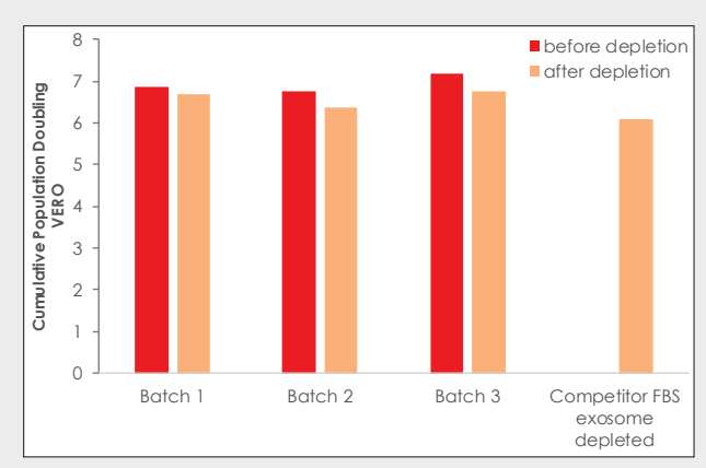
Figure 4 : Comparison of VERO cell lines proliferation at day 7 (Passage 2) with 3 different batches before and after depletion and with one competitor FBS exosome depleted. The culture feature for VERO (20000 cells/cm²) are: DMEM with 10% FBS at 5% \rm CO_2 - 37°C - 6-wells plate.

Depletion treatment doesn't impact the cell growth.